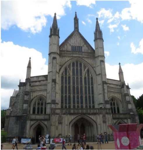
Ely Cathedral – Norman Architecture