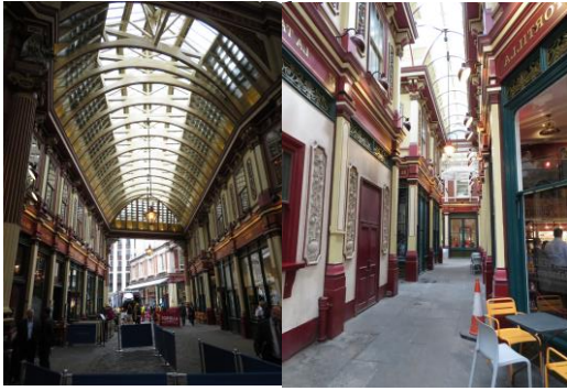
Leadenhall Market – Victorian Architecture