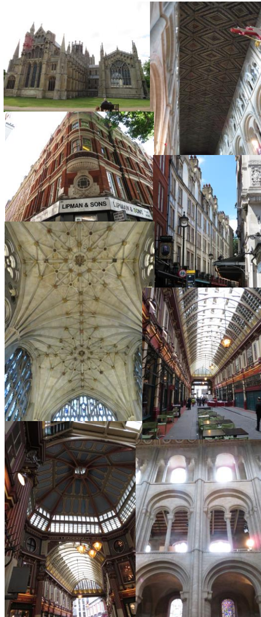
Picture Gallery of Norman and Victorian Architecture